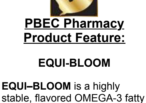
acid supplement for horses. It improves hair coat, body

condition, and expression of estrous behavior. OMEGA-3 fatty acids have been demonstrated to be antiinflammatory and to increase pregnancy rates and sperm production. Additionally, vitamin A, vitamin E, selenium, and zinc are included in EQUI-BLOOM to replace any deficiencies in the diet.